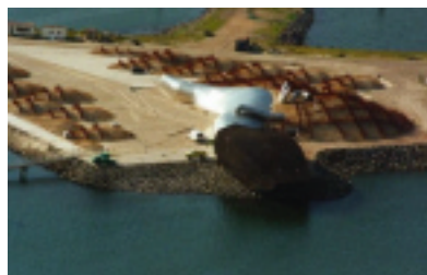
The Water Pavilion - the Salt Water side by Oosterhuis in the front and the Fresh Water side by Spuybroek in the back.

"Architecture Goes Wild", as the Dutch architect Kas Oosterhuis put for several years now [Oosterhuis, 1999] and his aim is to create literally moving and interactive buildings [Oosterhuis, 2002]. An early example of this approach can be seen in the Water Pavilion built in Zeeland in 1995 -1997 as shown in the figure below. One building, the Salt Water Pavilion, was designed by Oosterhuis Associates and the other part, the Fresh Water Pavilion, was designed by Lars Spuybroek (NOX Architects). To create the content of the buildings a team of people was involved including composers, VR programmers, visual artists, and interaction engineers.