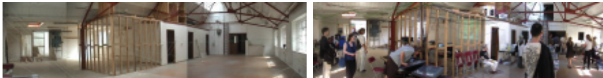
The transformation of the space (an old water mill) by the Meta-Orchestra

Another example is the Meta-Orchestra, founded in 2000 as a result of an European project [Bongers et al, 2001] [Impett and Bongers, 2001]. It is varying group of artists and researchers from different countries and different disciplines such as music, dance and video, using electronic technology which is networked. A concert of the Meta-Orchestra surrounds the audience by the physical presence of its members, the multi-channel sound system and video projections. The picture below shows a typical performance set up, at the Dartington Summer School in Devon, August 2000.