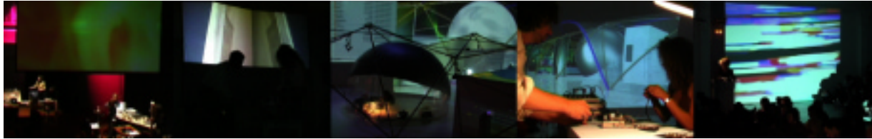
Some images of various Video-Organ performances

The pictures below show some examples of performances that have taken place in a variety of locations such as an old warehouse now art gallery, a former church, a house of the future (!). A performance in July 2002 will transform the extended architectural space in and around the square blocks of a building out in the fields near Barcelona by projections of sounds, lights, fire, video and slide images.