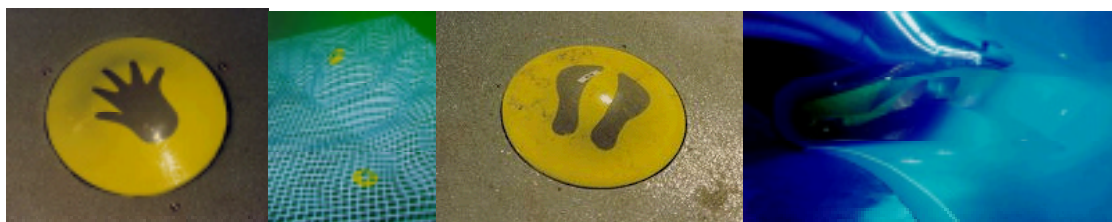
Some of the sensors and projections in the Fresh Water Pavilion

Inside the Fresh Water Pavilion blue light moves back and forth, sounds are placed in different locations and projections (of wireframe surfaces) deformed by audience actions. In-space sensors (photocells) were used to sense presence of people in certain areas, and people could pull ropes or push sensitive areas as can be seen in the figure below. All this influenced directly or indirectly the behaviour of the space. In the Salt Water Pavilion also the entry of daylight was regulated, as well as the water level inside the building. Events were in this case also depending on environmental parameters from a weather station.