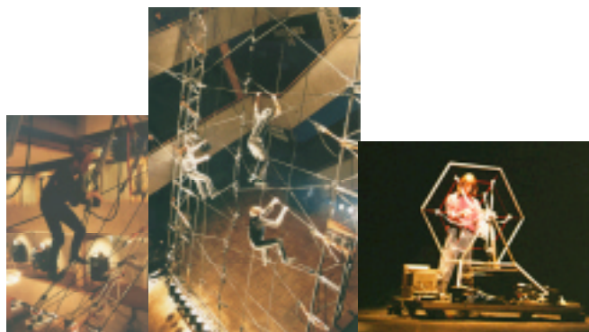
The members of SensorBand on the SoundNet (left and middle), and the original Web (right)