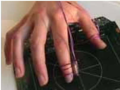
Figure 5. The Tabletring

placed in a ring on the finger (as shown in Figure 5) of the player while the rest of the electronics were placed in a bracelet. Using Richard Dudas 'wacom' object the movement of the finger is read in 9 bit values in Max. These values were used to control the parameters of a resonating filter.