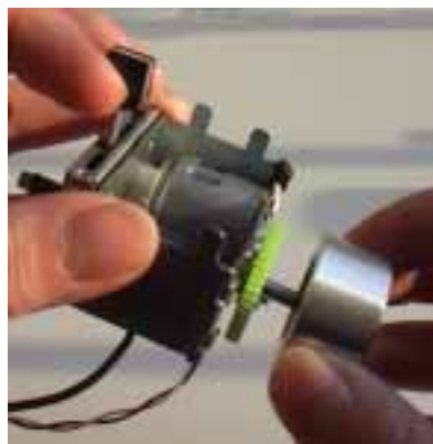
Figure 4. The Turnamin

The Turnamin (or Turn 'm In) is inspired by the use of turntables by DJ's, spinning a little wheel influences the playback speed of a sound sample ('scratching') and video clip. It is based on a small motor which acts as a dynamo, and generates a movement speed dependent voltage which is fed into the Microlab. A few diodes limit and channel the voltage (which reverses polarity depending on the direction of turning) into two separate channels. It was found that the range of the readout was a lot smaller than the real vinyl thing (limiting factors are A/D conversion and the MIDI protocol) so a small slide pot had to 'grow on' to control a multiplication factor. Usually the sound consists of some loud and clear drumbeats, which work well when played very slowly and are more rhythmic when played fast.