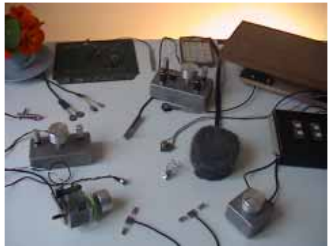
Figure 1: Part of the Video-Organ control surface

sound to be controlled live - film-maker Andrei Tarkovsky writes 'time becomes the very foundation of cinema: as sound is in music, colour in painting, character in drama' [17]. The development of a tool for live video performance takes this time based medium to another level, incorporating a dynamic interpretation of space as discussed in the section on 'elastic narrative' below. Several performances with the video-organ, as described in this paper have helped us to assess the reasons, problems and benefits behind the move towards performance and the live possibilities of video and sound placed in space.