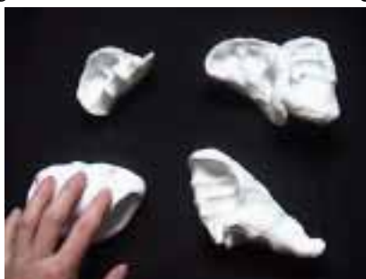
Figure 7. Clay models

Throughout this paper we have mentioned that developing a new instrument is not an easy task, and introduced a structured and modular approach. By focusing on the content of the compositorial material rather than the interface, we felt it was possible to perform with the instrument even from its most rudimentary state. After several successful performances we can conclude that this approach is valid, also feeding back the experiences of performing with the instrumentlets into the design process.