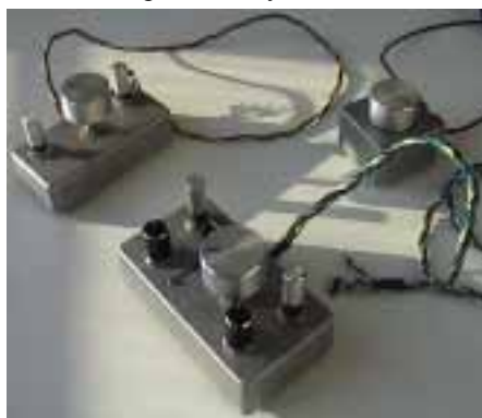
Figure 3. The Knobbieboxes

Using an assembly of several potmeters, the Knobbiesboxes are applied to control several closely related parameters in a more precise way.