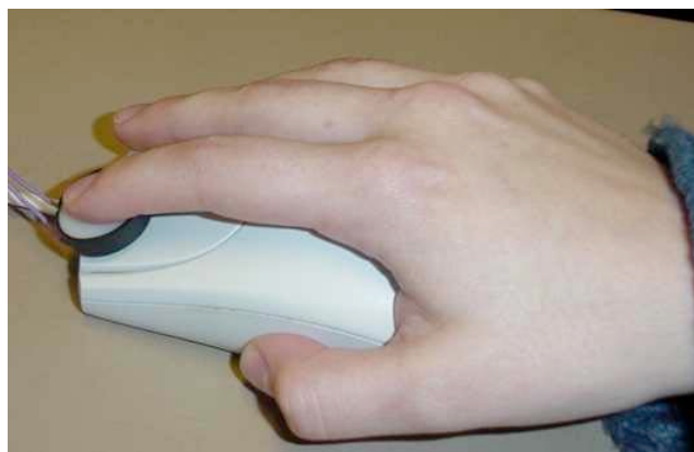
Fig. 1. Mouse with the vibrotactile element.

Many everyday interactions with physical objects that we manipulate are guided by a variety of (redundant) feedback modalities, such as touch, sound, smell or vision. This is true not only in the real world, it can also be expected to be true in the 'virtual world' as generated by the computer. However in the current computer interface paradigm based on windows, icons, menus and pointer (WIMP), the human sense of touch is not actively addressed by the system. All one can feel are things like the texture of the mouse pad or the resistance of keys, which is only limited as a source of information.